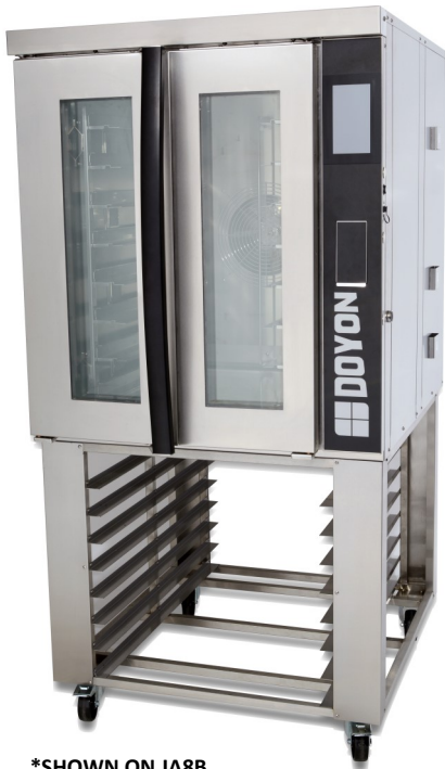
*SHOWN ON JA8B

PROJECT _____ ITEM NO. _____ NOTES _____ MODEL NUMBER: JA8X , JAX8G , JA8XR